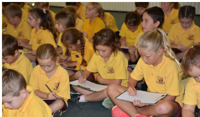
Students having fun whilst drawing too!