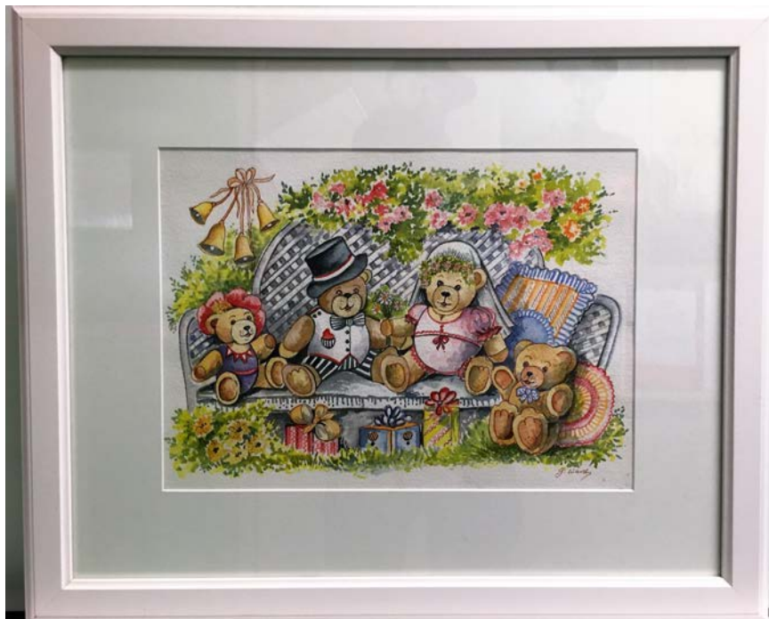
Second Prize Art Raffle – by Gill Ward “Teddy Bears in the Garden” Value - $295 - $1 per ticket (tickets available from school office)