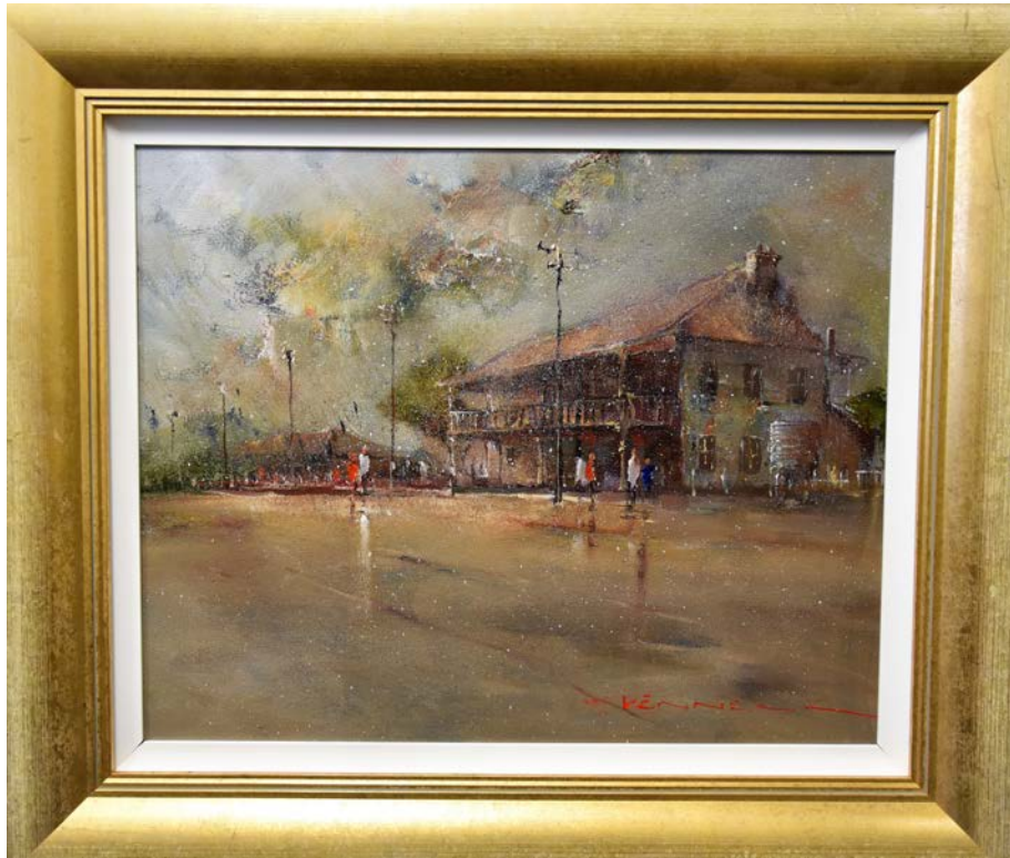
First Prize Art Raffle – by Peter Fennell “The Early Opener” Value - $2400 - $1 per ticket (tickets available from school office)