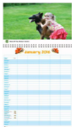
Family Planner - $15