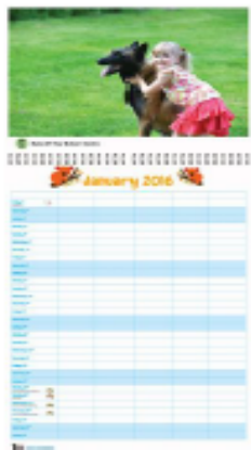
Family Planner - $15